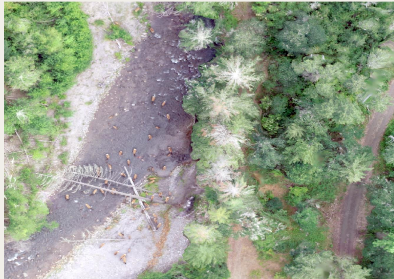
2019 Drone Flight