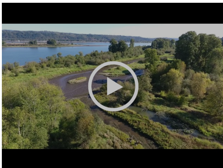
Batwater Station, approximately one year after our habitat restoration project wrapped up.