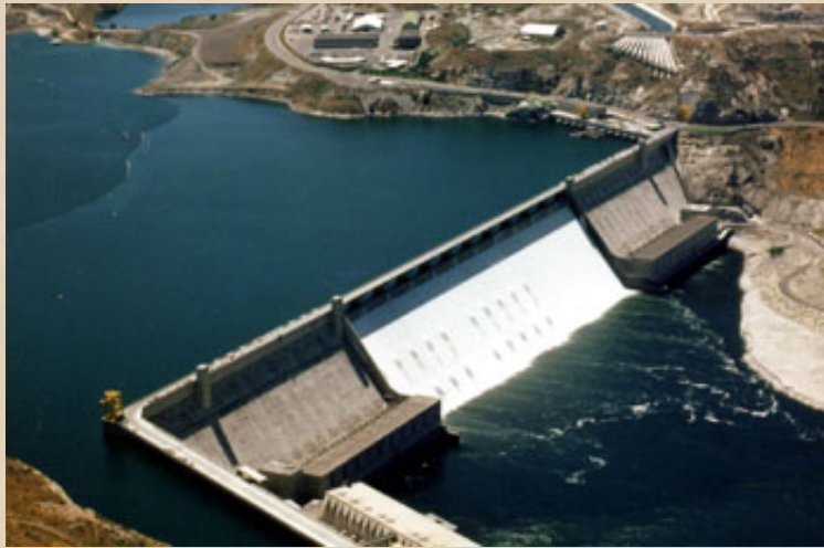
Grand Coulee Dam