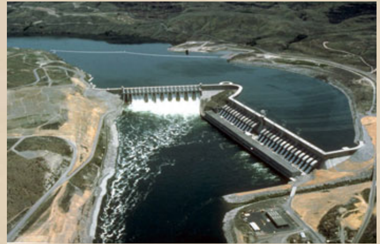
Chief Joseph Dam

Salmon and other fish passage must be restored to historical habitats in the Upper Columbia and Snake River Basins.