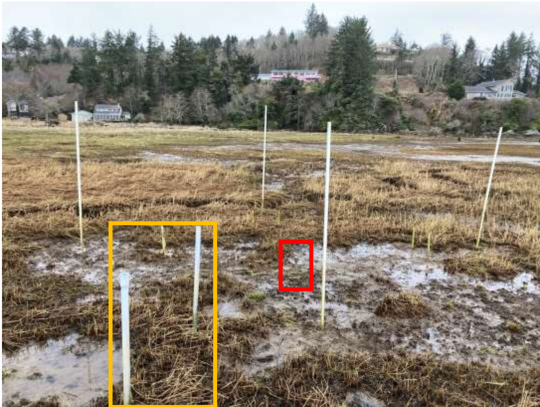
Baker Bay Marsh (BBM)