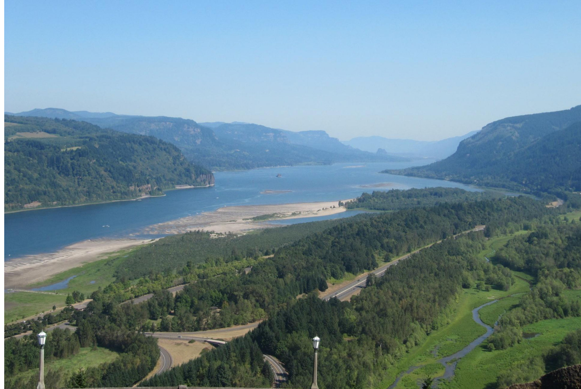
Figure 1: Columbia Gorge, Columbia River, near Portland, OR, 2011

"The Columbia River (CR) is a major river in North America, and is vital to North West American economy (e.g. fisheries, hydropower, shiptraffic) [Kukulka and Jay 2003]". Many studies have investigated CR hydrodynamics [Giese and Jay, 1989; Jay et al., 1990; Sherwood et al., 1990; Kukulka and Jay, 2003]. In this study, the effect of a hypothetical tsunami, similar to what happened in March 2011 at Tohoku, Japan, is studied for the Columbia River estuary.